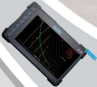
Ultra Sonning Testing Machine